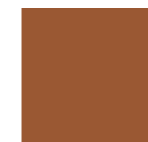
13 TOBACCO 4100811