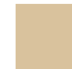
18 SAND 4100816