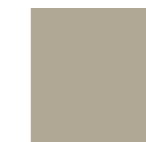
23 GREY 4100821