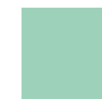
41 MINT 4100839