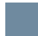
31 CERULEAN 4100829