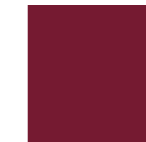
04 BORDEAUX 4100802