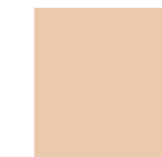
11 POWDER 4100809